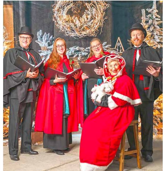
We thank KCCA for continuing their support of Hello Neighbors and the Monthly Musical Concerts.

KCCA Clubhouse Sunday, December 8 2:00 - 4:00 pm