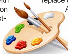
exhibit in the Arts and Crafts Building. In January, art with the theme WHAT MAKES ME SMILE will replace the current display.

I’m sure all artistic souls are enjoying this beautiful, colorful season with so much inspiration for art. With Christmas just around the corner, there is a wonderful opportunity to create, sell and/or gift art to friends and family.