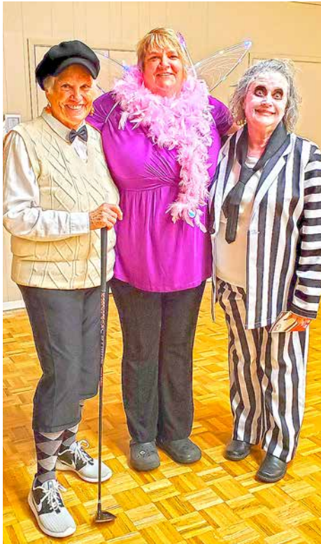
We have our winners!

For the lady golfers looking for more information on the club and how to join us for the 2025 season, be sure to stop by the Pro Shop. Opening day is planned for the first Wednesday in April next year. See you at the course in 2025!