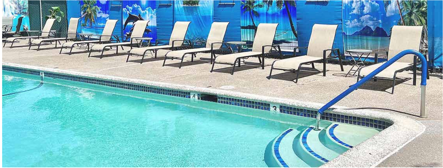
From The 2024 Pool Committee

Summer is here, and it's finally time to enjoy our beautiful, heated outdoor pool again! It is located to the right of and behind the Golf Pro Shop. You will need to tap your KCCA AMENITIES KEY CARD on the vertical pad next to the sign-in podium to get in. If you need one, contact the office.