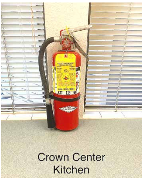
Crown Center Kitchen

the Crown Center. The AED device in the Crown Center is located in the workout room.