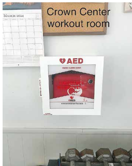
Crown Center workout room