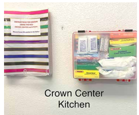
Crown Center Kitchen